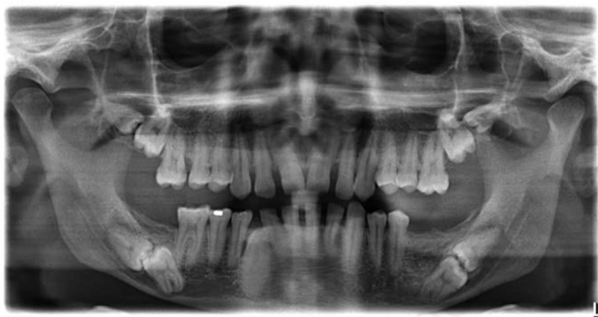
Figure 1. Panoramic radiograph showing bilateral mandibular kissing molars.