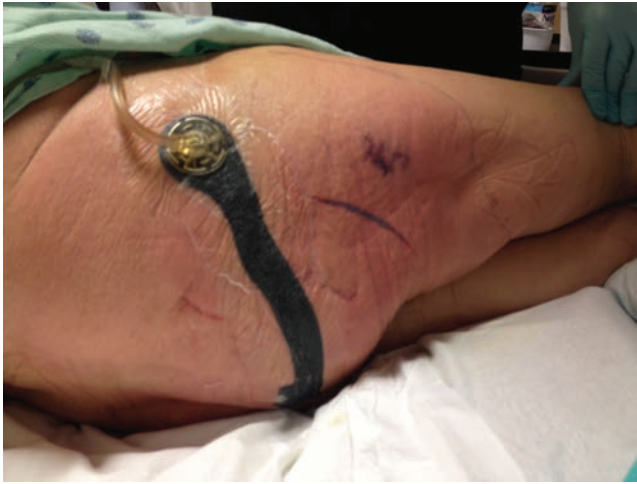
Figure 1. The patient's right buttock showing residual cellulitis after surgical debridement and negative wound therapy implementation.