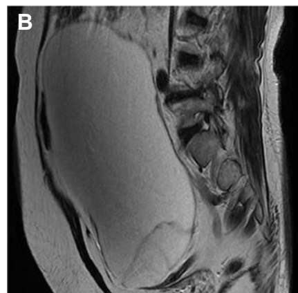
Figure 1. A) An ultrasonography image of the pelvis shows a large multicystic mass. B) A magnetic resonance image of the pelvis shows a large multicystic mass.