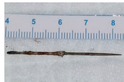
Figure 3. The tapestry needle, which was successfully removed from urethra.